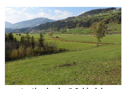
retention basin, © Schindelegger

The representative of the upstream landowners reported that the current compensation scheme is the result of lengthy negotiation process among the more than sixty landowners affected by the flood storage project. The landowners had only agreed to provide their agricultural land for flood storage, if a number of conditions were met, including the assessment of current land and property values as a basis for determining flood losses, as well as reducing the incline of the horizontal time to allow mechanical cultivation. The representative of the downstream beneficiaries, on the other hand, demonstrated that agricultural landowners benefitted from re-rezoning agricultural land into building land and, therefore generally supported beneficiary contributions to the compensation fund by means of land value capture.