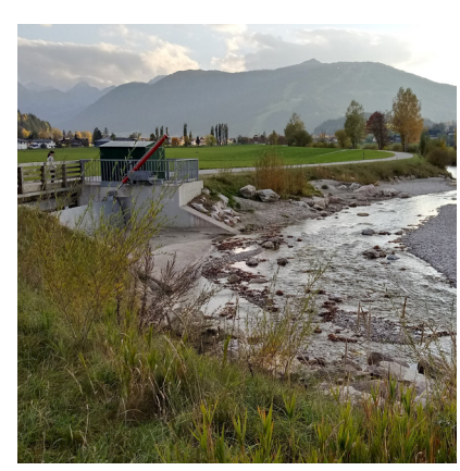
inflow retention basin