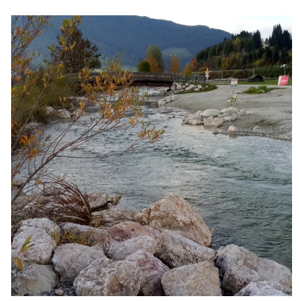
river widening