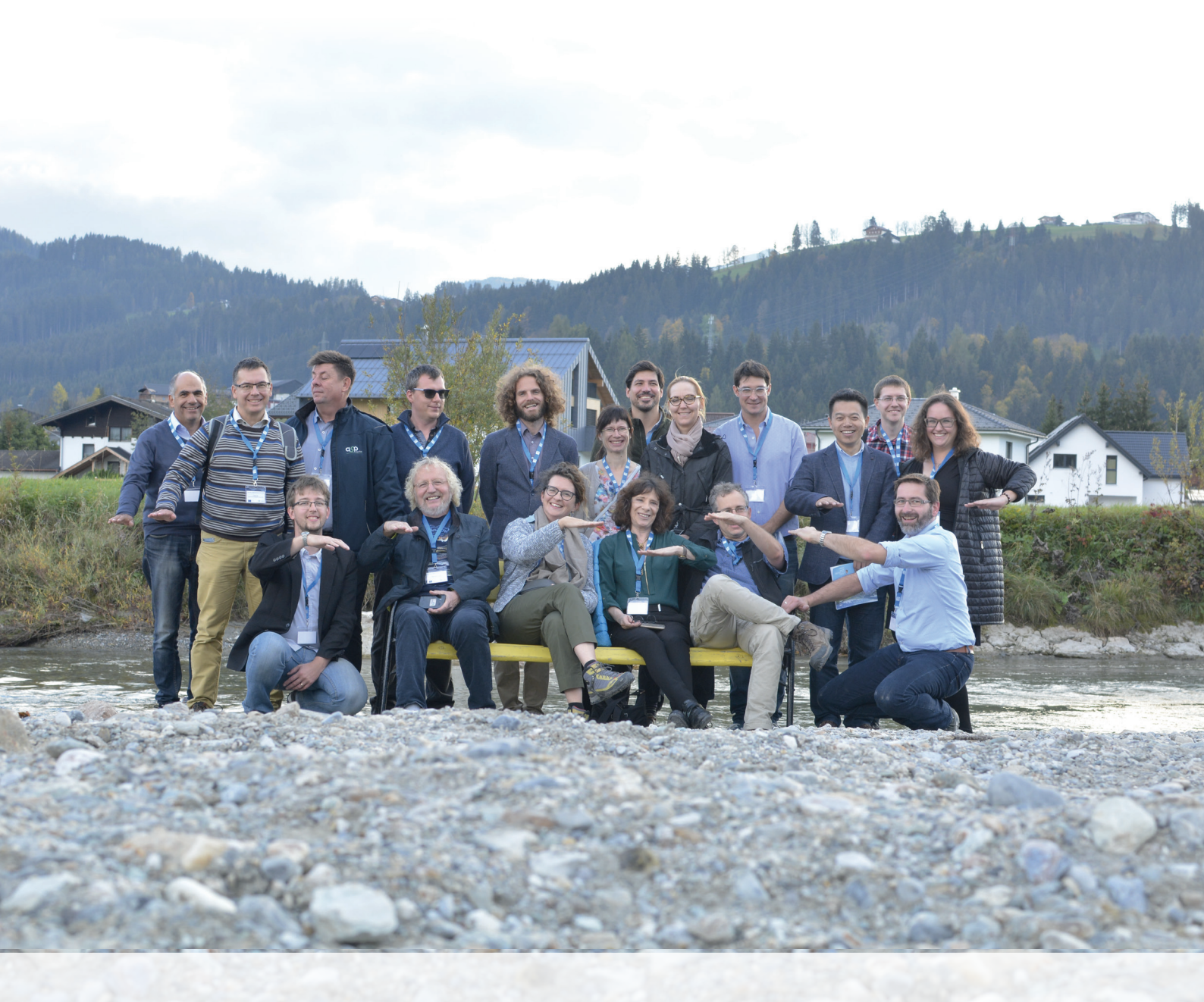
Further information: www.land4flood.eu