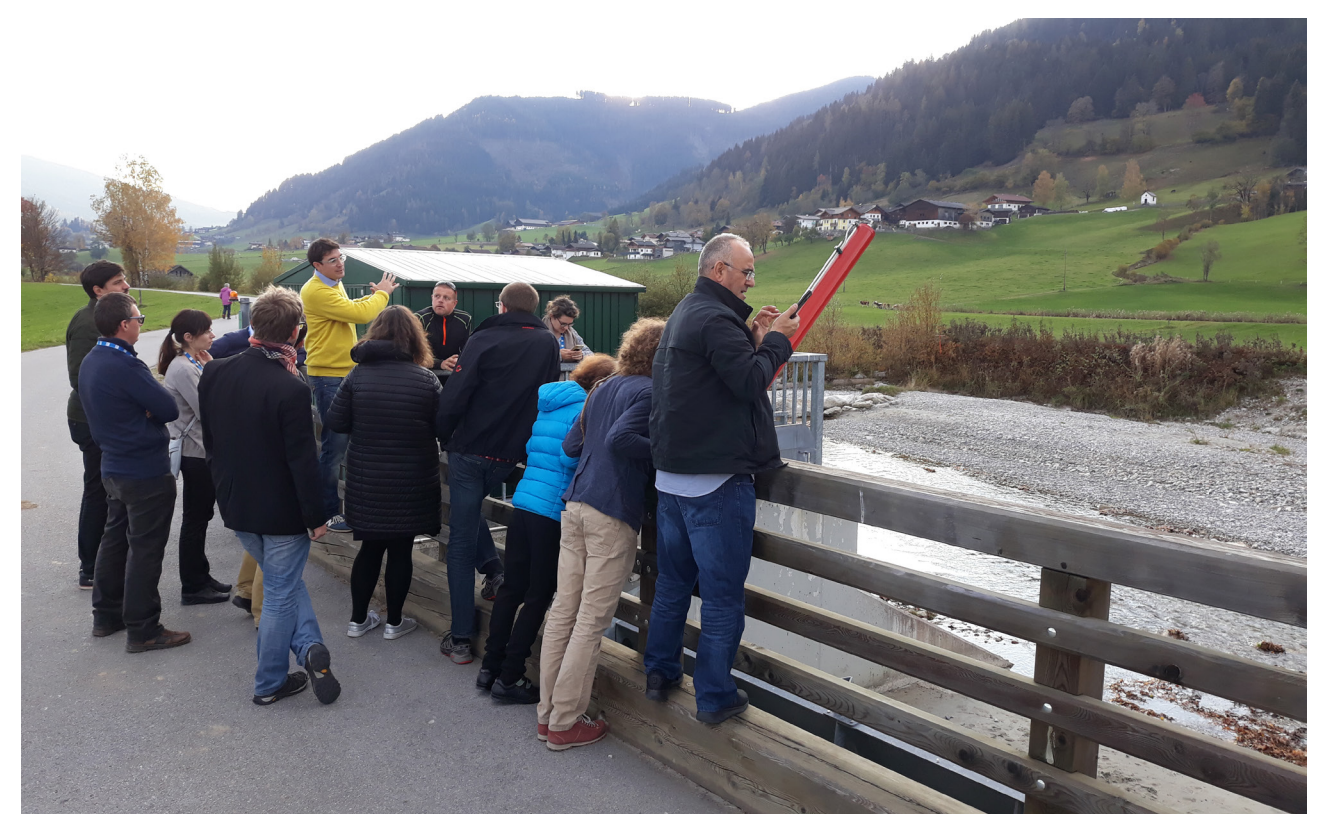
retention basin, Altenmarkt