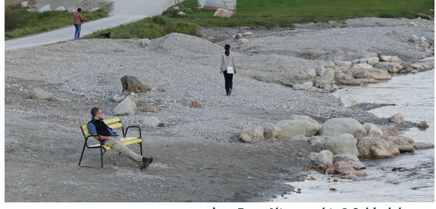
river Enns Altenmarkt

Building a better understanding of flood storage compensation demands i) bridging disciplinary fields, ii) facilitating the exchange between science and policy, and iii) interacting with local stakeholders. In this vein, the regional workshop brought together nineteen participants with a wide range of disciplinary backgrounds, including hydraulic engineering, spatial planning, agronomy, law and economics. About half of the participants were researchers, while the other half included practitioners. In the course of two stakeholder dialogues the participants had the chance to engage with local stakeholders, including representatives of municipal authorities, landowners and other actors involved in the implementation of the flood compensation schemes.