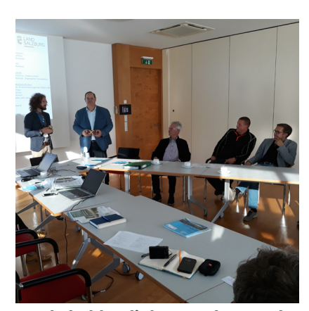
stakeholder dialogue, Altenmarkt

legal possibility of compulsory membership. The cooperative did finally contribute € 864.000,-to the initial construction costs. The technical measures are now owned by the cooperative and are maintained by annual fees paid by the beneficiaries. The future development, possible due to the technical project, was not considered in the calculation of initial contributions.